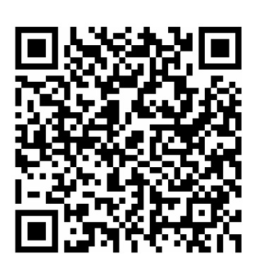
Scan for <u>more information</u> and <u>registration details</u>

In June 2023, GPEx presents the following webinar campaign on behalf of the Jodi Lee Foundation – Created for General Practitioners, the webinar covers the national bowel cancer screening program and provides participants with the skills and knowledge they need to support their patients participation in the program.